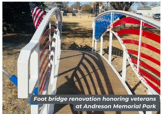
Foot bridge renovation honoring veterans at Andreson Memorial Park

community downtown events with overhead audio for music, entertainment, and announcements. The plan included the purchase of 18 state-of-the-art, commercial speakers, mounted on nine poles between the 200-block and 500-block of Main Street. The girls wrote grants, worked with the city, talked to the vendor, and asked donors for donations. They did a wonderful job!