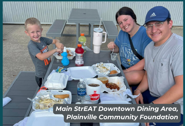
Main StrEAT Downtown Dining Area, Plainville Community Foundation