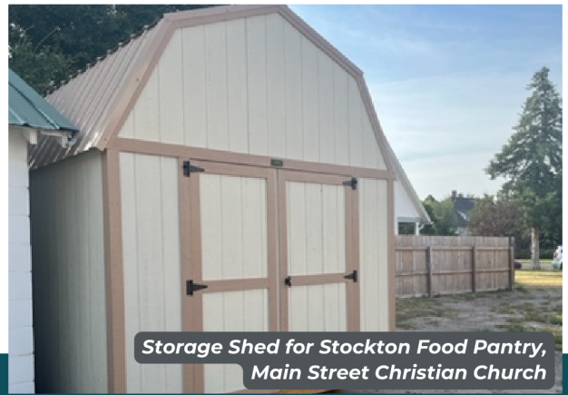
Storage Shed for Stockton Food Pantry, Main Street Christian Church