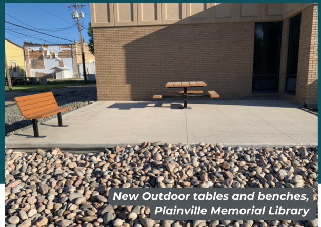
New Outdoor tables and benches, Plainville Memorial Library