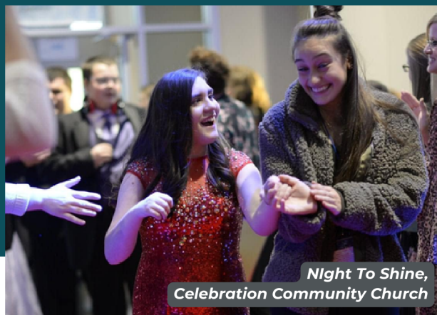
Night To Shine, Celebration Community Church