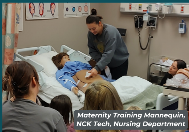
Maternity Training Mannequin, NCK Tech, Nursing Department