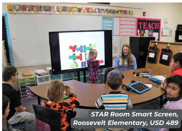
STAR Room Smart Screen, Roosevelt Elementary, USD 489

In the following weeks, they were paired with groups in Ellis to develop grant applications for projects in need of funding. The result: seven applications, four funded projects, and a powerful example of student-community collaboration. This initiative not only equipped students with practical skills but also empowered organizations to submit new grant applications. Great job to all!