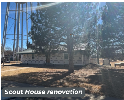
Scout House renovation

The Scout House in WaKeeney is a gathering space for a number of community groups, from boy scouts to dance clubs. With a myriad of renovations needed to update the 82-year-old structure, collaboration and partnership was still the key.