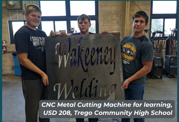
CNC Metal Cutting Machine for learning, USD 208, Trego Community High School