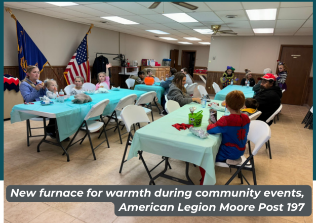
New furnace for warmth during community events, American Legion Moore Post 197