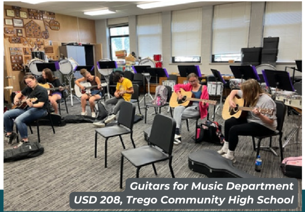
Guitars for Music Department USD 208, Trego Community High School