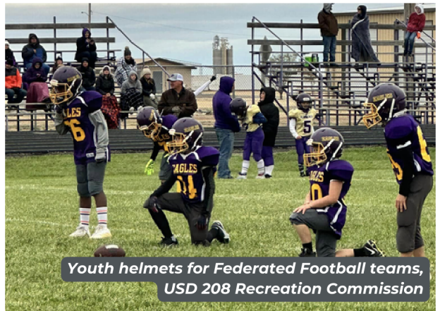
Youth helmets for Federated Football teams, USD 208 Recreation Commission